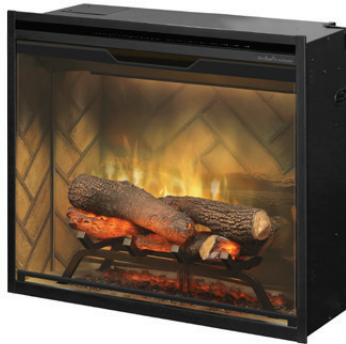
Also available in Herringbone Brick - RBF24DLX